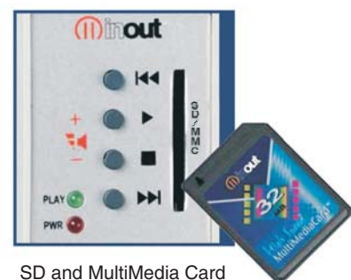
SD and MultiMedia Card